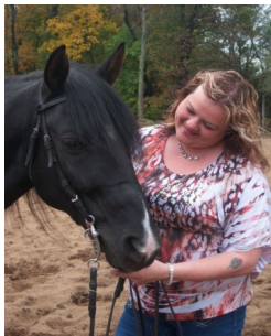
Johnny Be Good