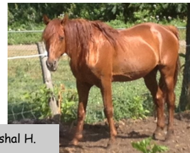
Sensation's Fire Marshal H.

6 yr old registered Quarter Horse mare Stands 15.3 hands tall.