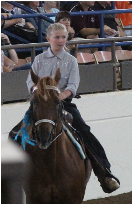
Illinois State Fair 2014