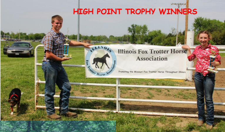
HIGH POINT TROPHY WINNERS