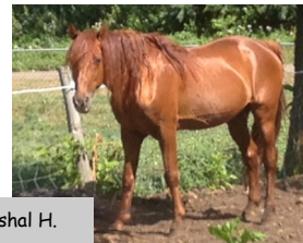
Johnny Be Good