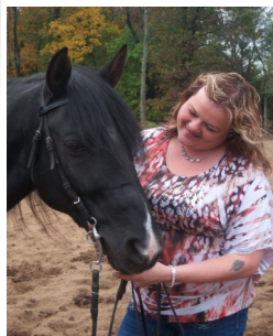
Johnny Be Good

Boarding ☺ Training ☺ Riding Lessons ☺ Clinics ☺ Youth Camps ☺ Farrier Service