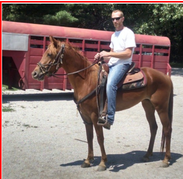
Broke and Gentle

I Just Want To Be Loved "BB" PRICE: $1,000.00 OBO SEX: Mare COLOR: Sorrel FOAL DATE: June 3, 2012 PEDIGREE: Captain Midnight Cardinal's Gunslinger & Southern Jazz REGISTRATION: 12-99087